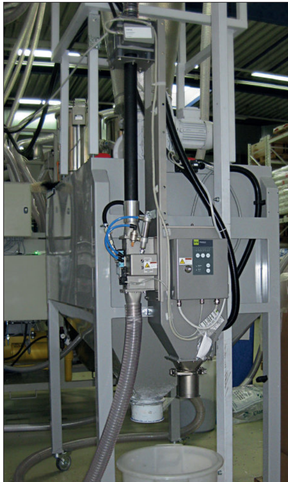
Installation example: Metal separator GF installed in a vertical pipeline (old version)

It detects all magnetic and non-magnetic metal contaminants (steel, stainless steel, aluminium, etc.) – even when they are enclosed in the product. Metal contaminants are ejected via the “Quick-Flap” separation unit.