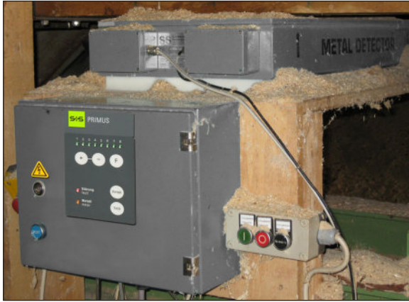
Installation example: Plate type detector ELS with control unit PRIMUS analysing wood off-cuts (old version)