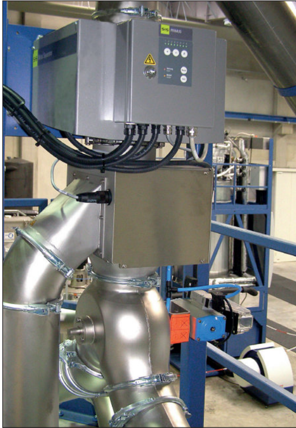
Installation example: Metal separator RAPID VARIO-FS used for the quality control of PET regenerate. (old version)