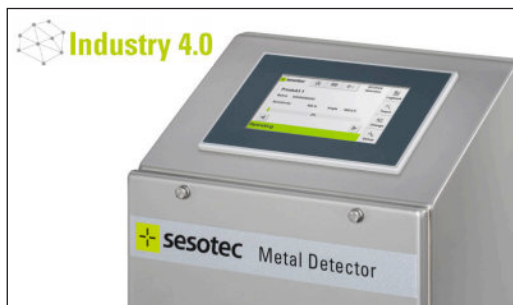
Electronic Control Unit GENIUS ONE with 5" colour touchscreen (Industry 4.0-ready / IOT-ready)