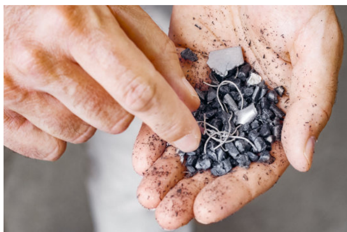
The RE-SORT metal separation unit for post-cleaning of heavily contaminated material

Integrated version: The RE-SORT metal separation unit can also be used within the central material handling system, where it acts as a metal pre-cleaning station.