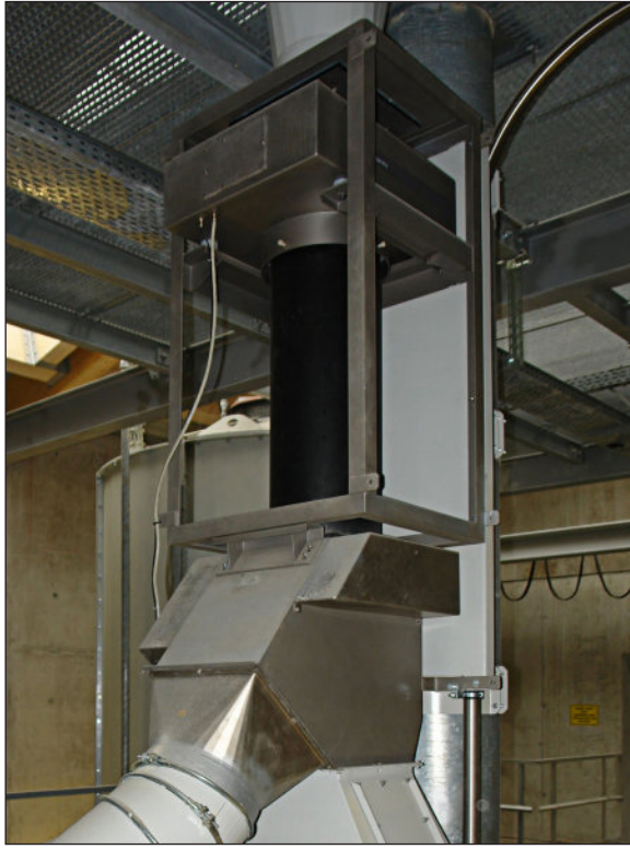
Installation example: Metal separator RAPID DUAL used for machinery protection during wood pellet production (old version)