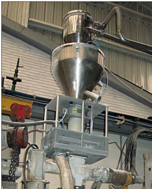
Installation example: Metal separator installed at the material infeed. (old version)

PROTECTOR-MF metal separators increase machine availability and productivity providing a fast return on investment.